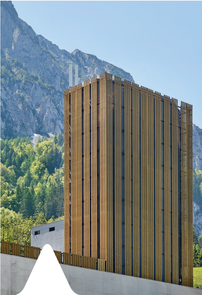
Bosruck Tunnel, Bosruck, Austria - Architect: Riepl Riepl Architekten - Product: Nordic Copper