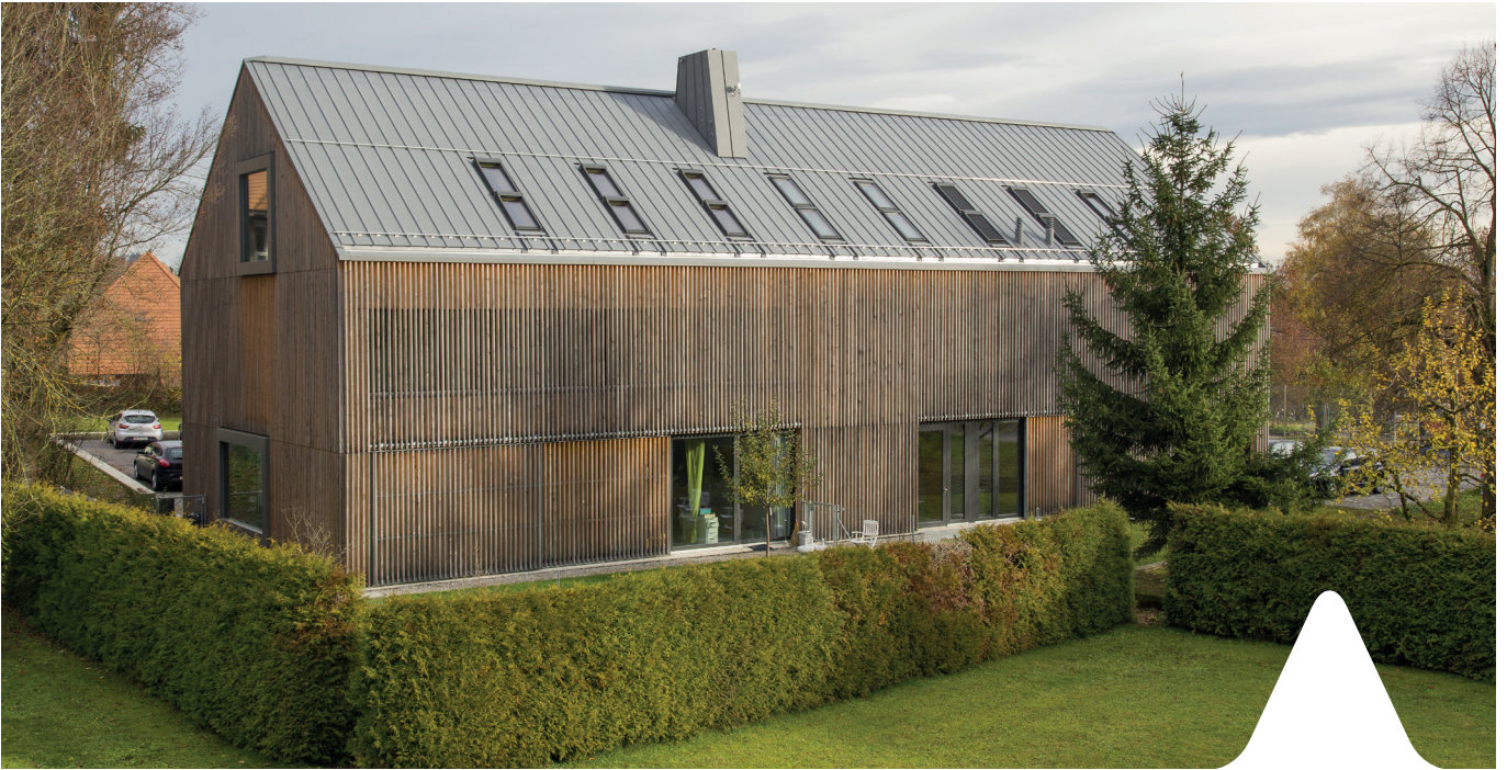
Gemeindezentrum, Gampelen (Suisse) - Architect: Spaceshop architekten GmbH, Biel - Product: VMZINC