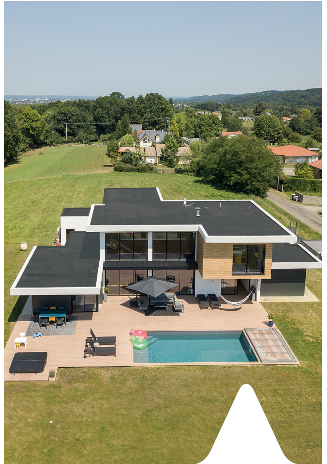
Individual house, Bernac-Debat (France) - Architect: Atelier Scenario - Product: EPDM membrane

VM Building Solutions® - 09/2024 - © VM Building Solutions